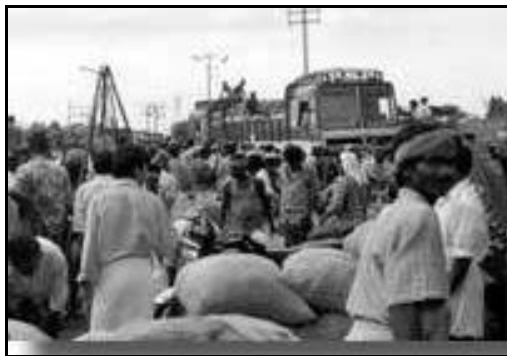
A market in Tamil Nadu