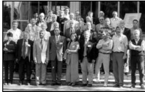
Baku conference delegates

to identify primary issues and research directions, and thereby develop a sound foundation for further activity and collaboration in this globally important field. A major focus of the workshop was to develop and identify resolutions to urban groundwater problems and develop an understanding of ways these resolutions can be achieved. For more details see: http://www.scar.utoronto.ca/~gwater/NATOARW2001BAKU/