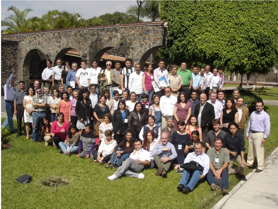
Group Photo of the Members of the National Colloquium: Groundwater in Mexico.