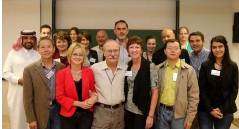
RGFC General Meeting in Budapest, Hungary