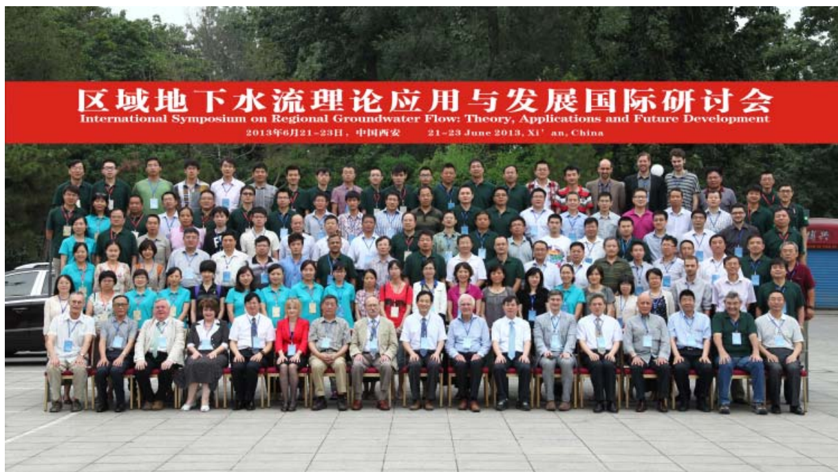
Group photo of the delegates of Xi'an Congress, China

There was a field trip to the Ordos Basin, one of the most intensively investigated basins in China. The participants found out that the Ordos basin is a perfect study area for further development of the theory of regional groundwater flow. The symposium, where views and experiences were exchanged on the advances and future development of the theory of regional groundwater flow, will enhance international cooperation and thus further development of the regional groundwater flow theory.