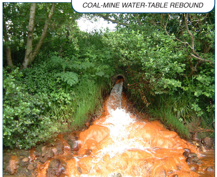
ACIDIC SPRING DISCHARGE FROM COAL-MINE WATER-TABLE REBOUND

In some regions major open-cast or subsurface coal mining continues to supply thermal power plants. In many cases this involves large-scale groundwater dewatering to facilitate safe mining, and this modifies the regional flow system and reduces resource availability for other users. Such activity is best planned using detailed hydrogeological knowledge, which will also be required to manage water-table rebound following mine closure. If this is not managed and treated appropriately, it is likely that unpredictable highly acidic spring discharges will appear, which can contain elevated concentrations of heavy metals. There is a huge historical legacy in this regard, which is presenting a major environmental challenge.