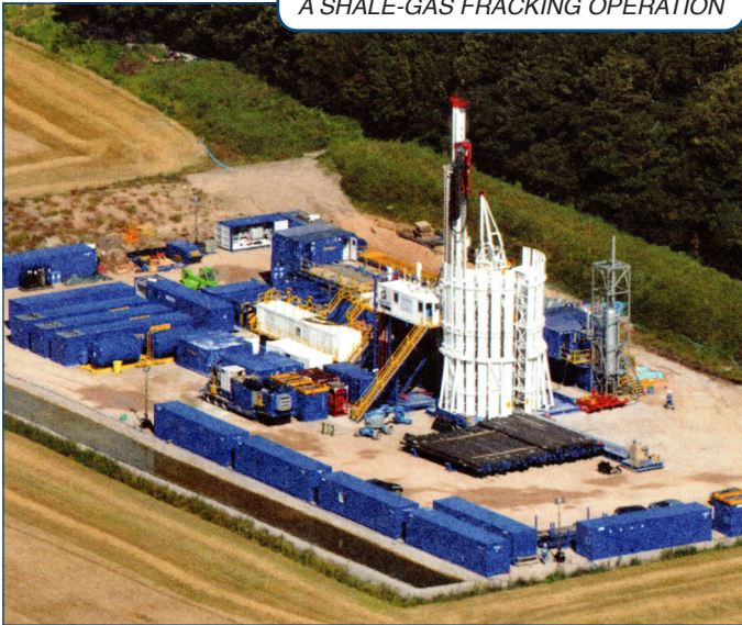
A SHALE-GAS FRACKING OPERATION

logical monitoring and evaluation of operations are required to identify those settings in which shallow groundwater is more susceptible to degradation. Addressing this will require improved cooperation and joint research between hydrogeologists and hydrocarbon reservoir engineers.