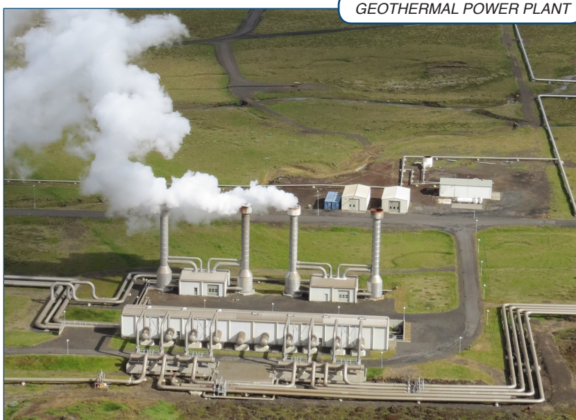
GEO THERMAL POWER PLANT

These resources usually occur deep underground and are characterised by high temperature ( >150^{\circ}\text{C} ) and in-situ pressure, but are of limited geographical distribution being mainly associated with volcanic activity. Where present they can be exploited by extracting water directly for power generation.