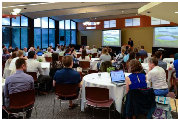
Keynote address by Okke Batelaan